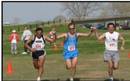
5th Annual Levee Top Run