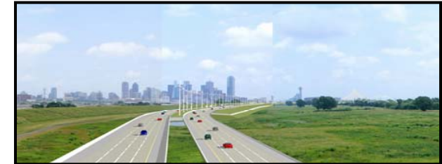
Trinity Parkway 30% Design Complete