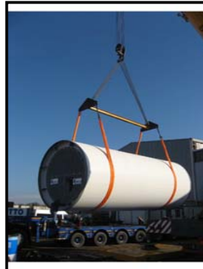
First shipment of steel arrives for the Margaret Hunt Hill Bridge